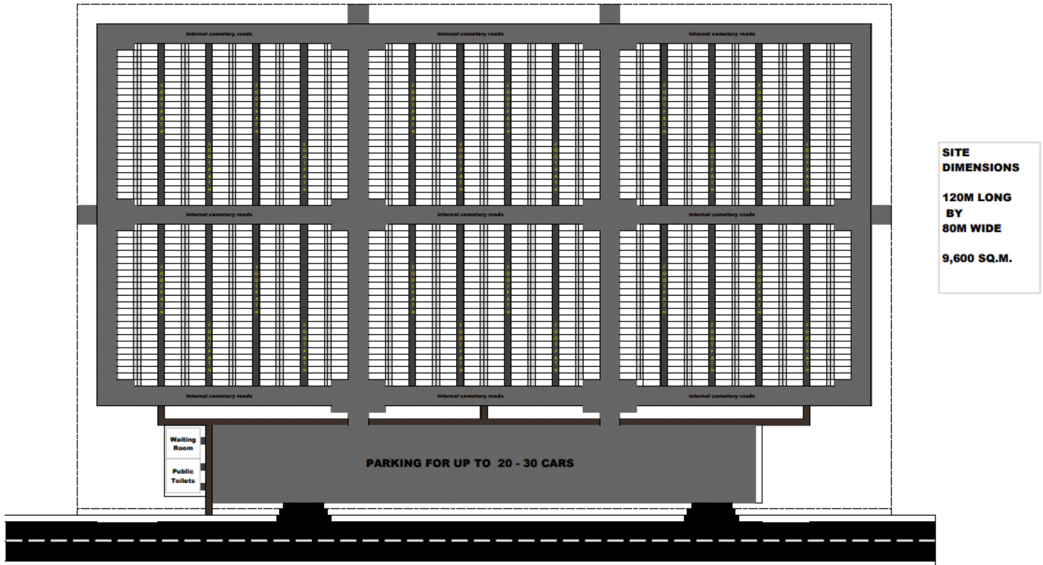
CAMPBELTOWN NEW CEMETERY - LAYOUT - 2214 LAIR SPACES

SITE DIMENSIONS 120M LONG BY 80M WIDE 9,600 SQ.M.